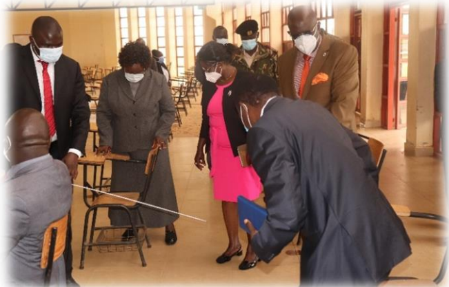
Prof. Magoha inspects the University's Multi-Purpose Hall together with other MMUST top officials.

The Cabinet Secretary for Education, Prof. George Magoha, on Thursday, 20 th August 2020, commended Masinde Muliro University of Science and Technology (MMUST) on its preparedness for post Covid reopening during an inspection